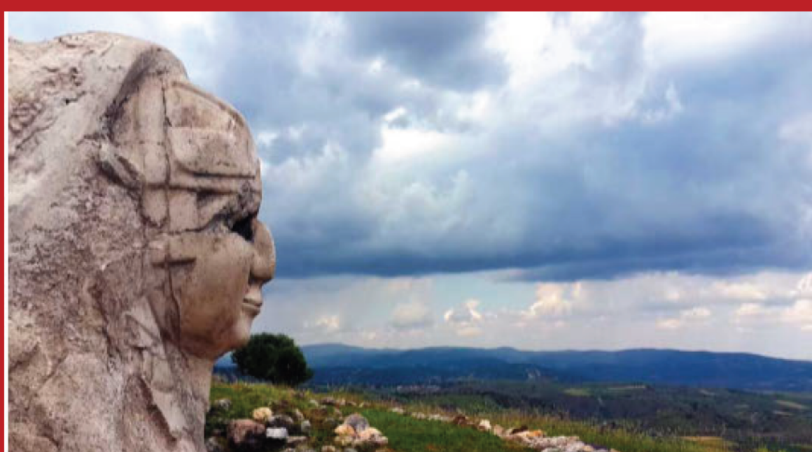
THE HITTITES EMPIRE , BRONZE AGE, BC. 1400-1500