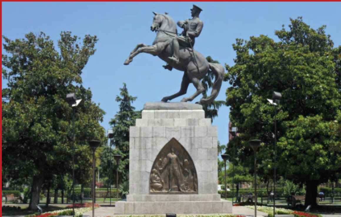
The father of modern Turkey "ATATURK " in Samsun