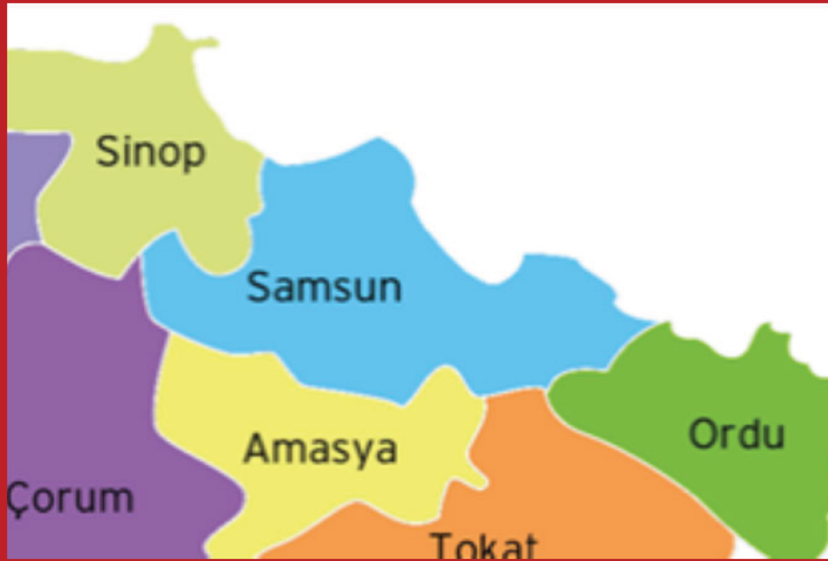
The map of central Black Sea Region

- Please inform us any allergy and vegetarian - Bring swimming clothes and shoes or slippers, no need to bring any tovel