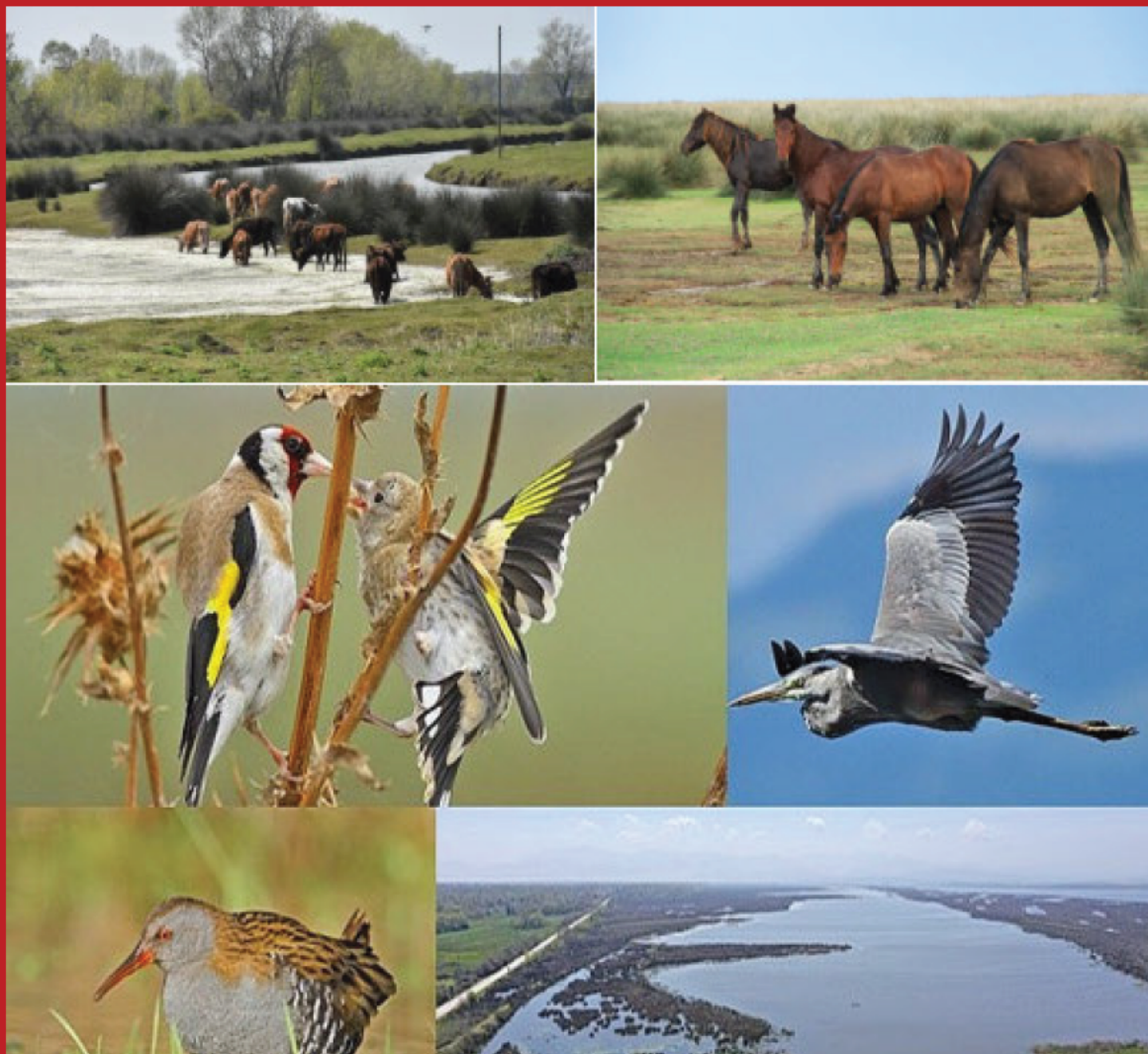
THE BIRD PARADISE OF KIZILIRMAK in SAMSUN