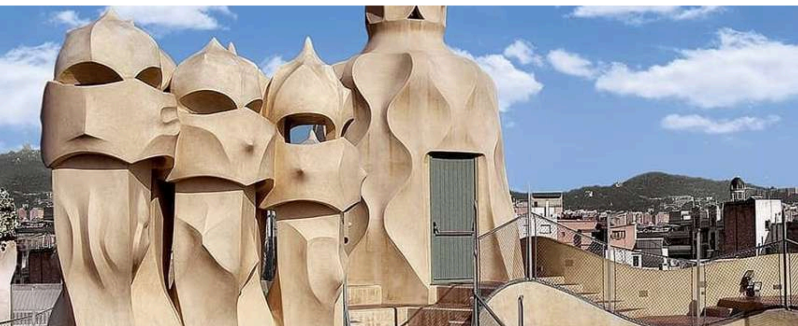
ROOFTOP OF LA PEDRERA

The hostel kitchen: You can enjoy breakfast included in your stay and get energy to spend a special day in Barcelona. The hostel located just 10 minutes from the train station and 30 minutes away from the city center.