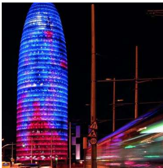
GLORIES TOWER VIEW POINT

Return to Hostel Pere Tarrès, dinner and accommodation