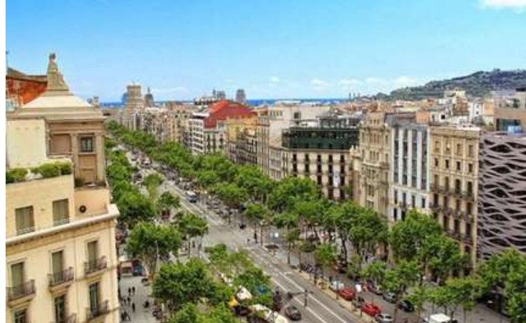
AERIAL VIEW P. GRACIA