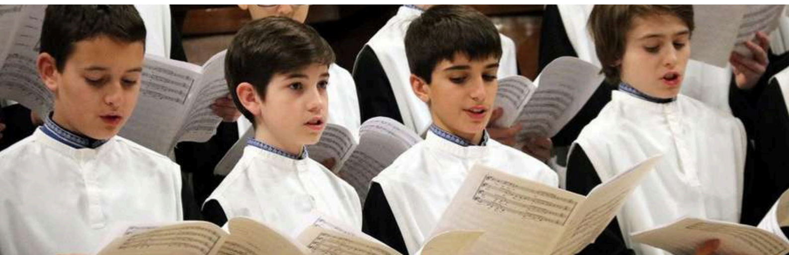
MONTSERRAT CHOIR SCHOOL