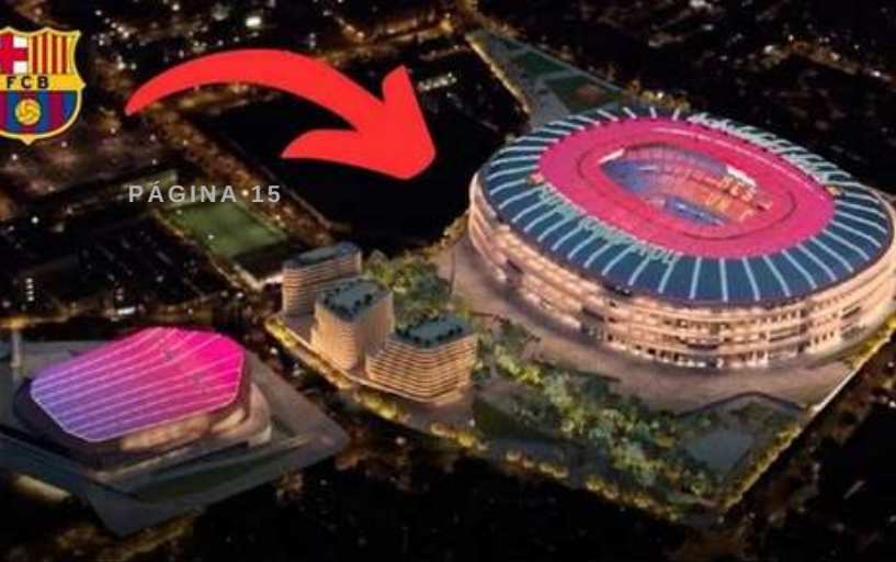
BARÇA NEW FIELD