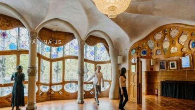
CASA BATLLO LIVING ROOM