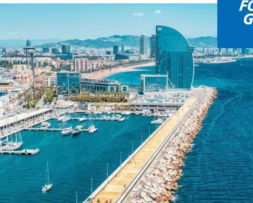
BARCELONA COAST AND W HOTEL