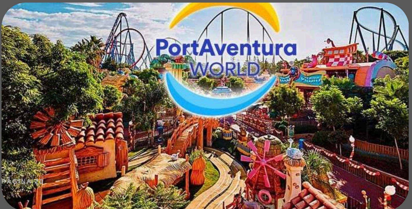
PORT AVENTURA WORLD

The Castellers de Vilafranca were founded in 1948 and they represent the great passion and tradition of their people.