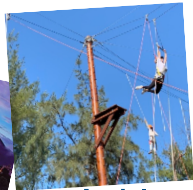
Aerial Adventure Courses