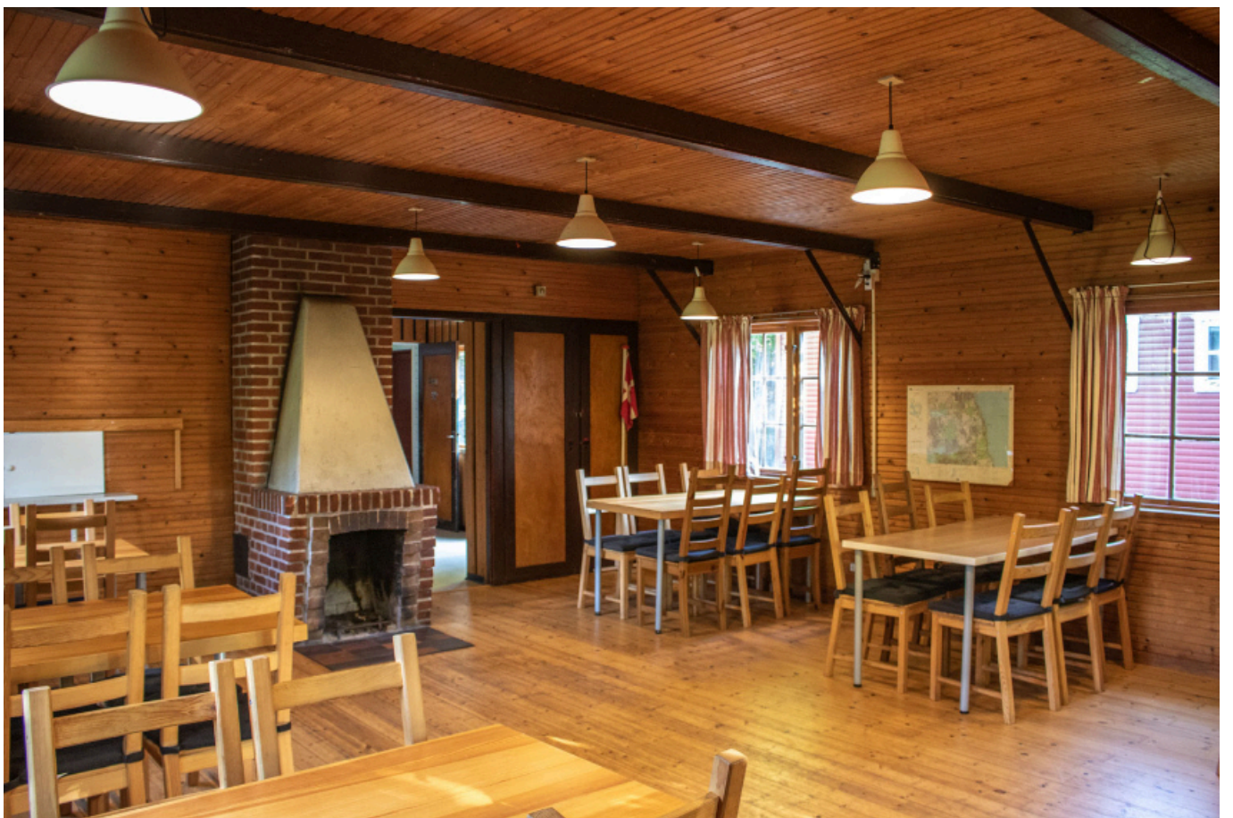
Hellerud scout cottage, Søterrassen 17, 2840 Holte, Denmark