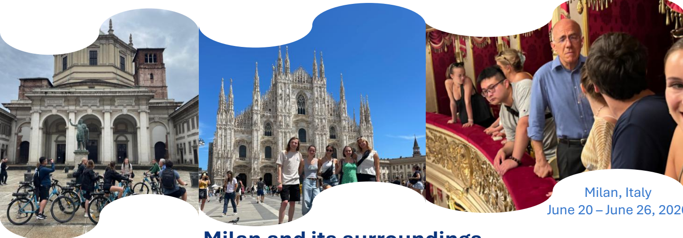
Milan, Italy June 20 – June 26, 2026