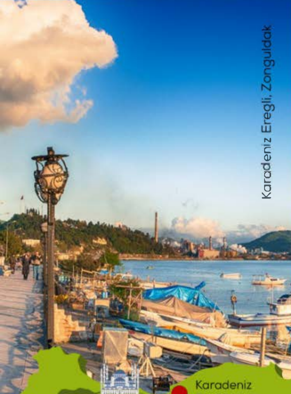
Karadeniz Ereğli, Zonguldak